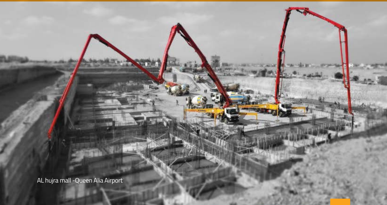
AL hujra mall –Queen Alia Airport