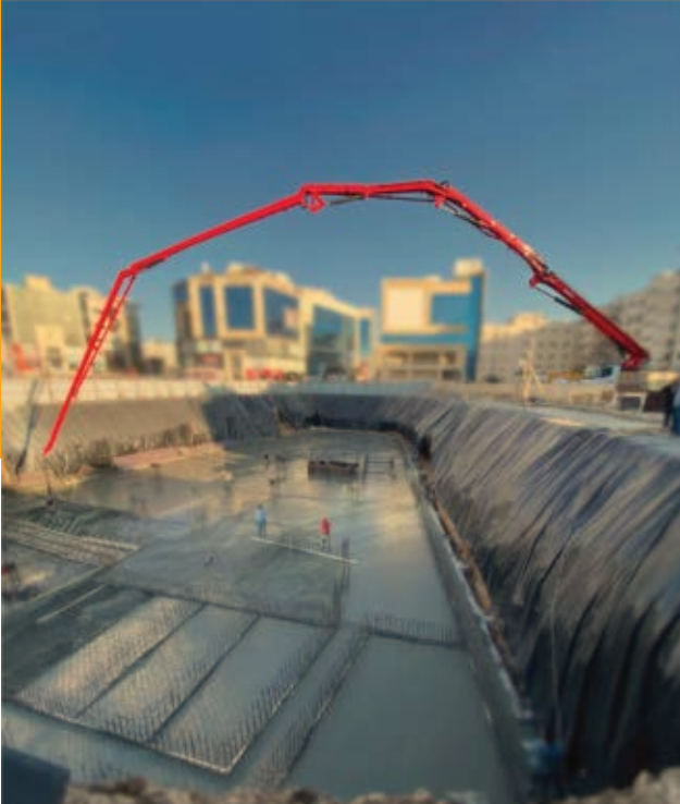
Basil Tannous Commercial Complex Seventh Circle