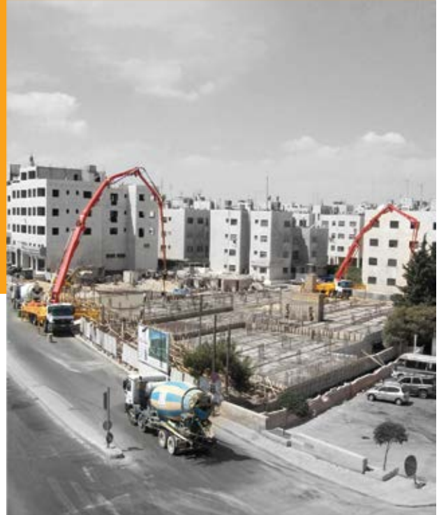
Um Alsumaḡ Commercial Complex