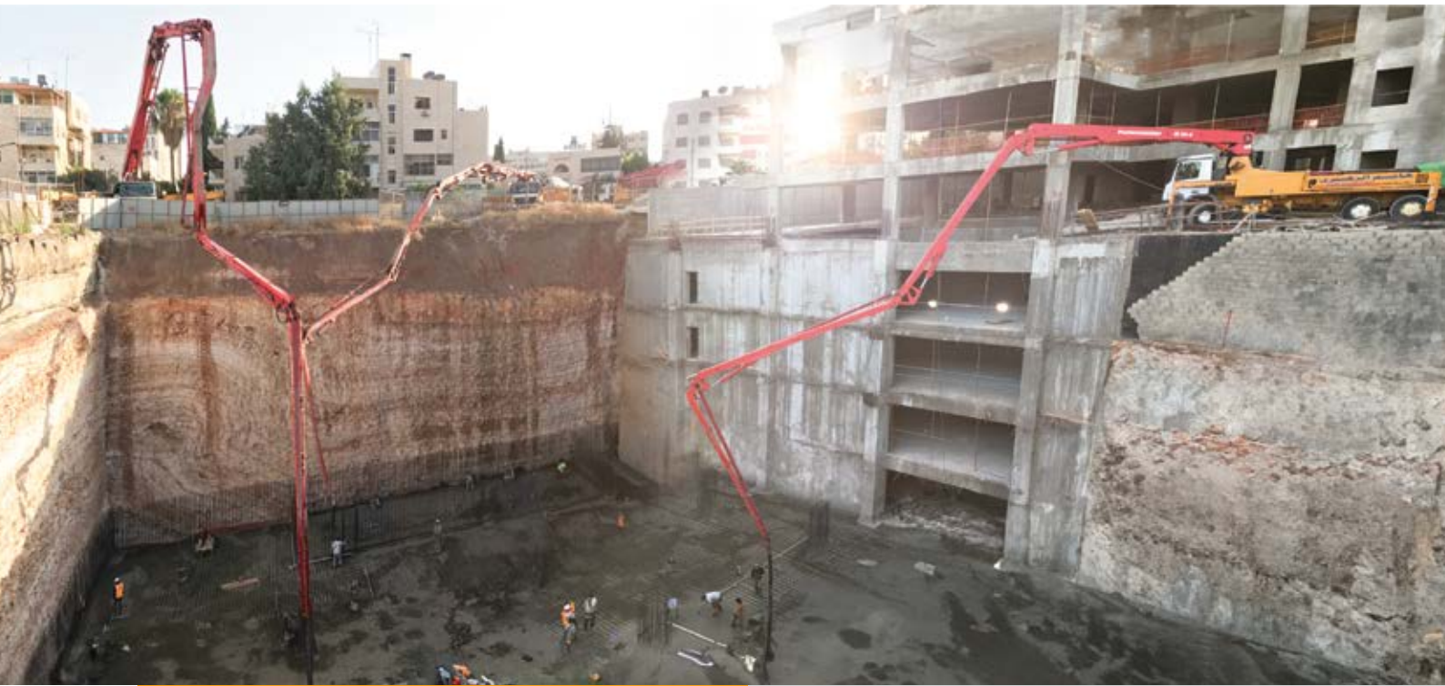
Al Kindi Hospital - Al Abdali