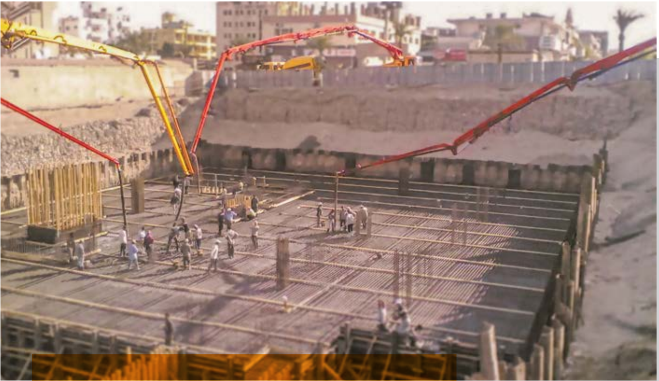
DoubleTree by Hilton - Aqaba