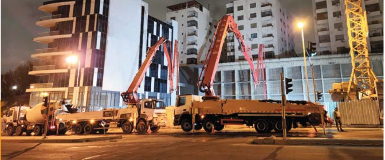
Raed Khalaf Commercial Complex - Wadi Saqra