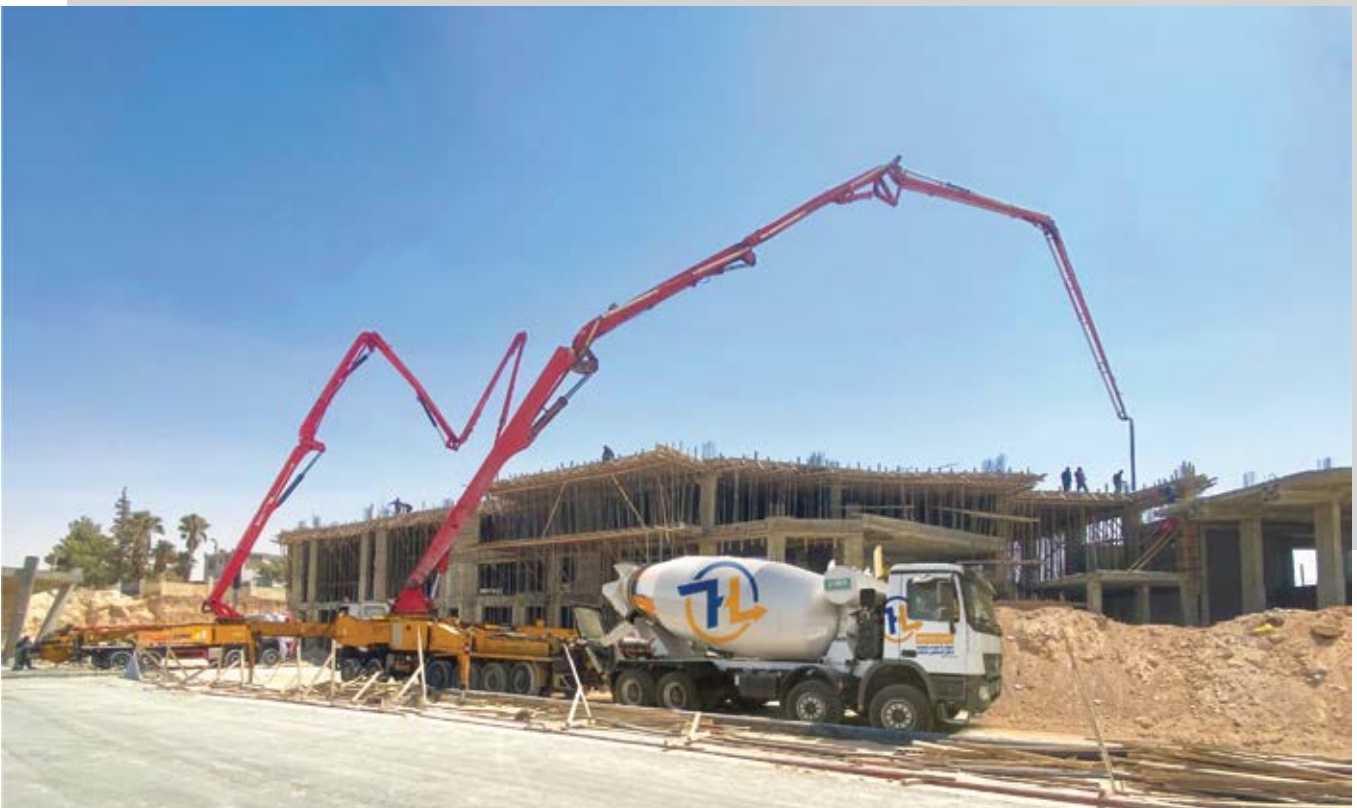
AL hujra mall -Queen Alia Airport .